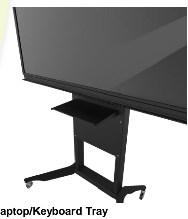
Laptop/Keyboard Tray Front Mounted*